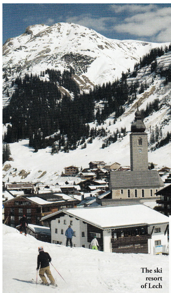
The ski resort of Lech