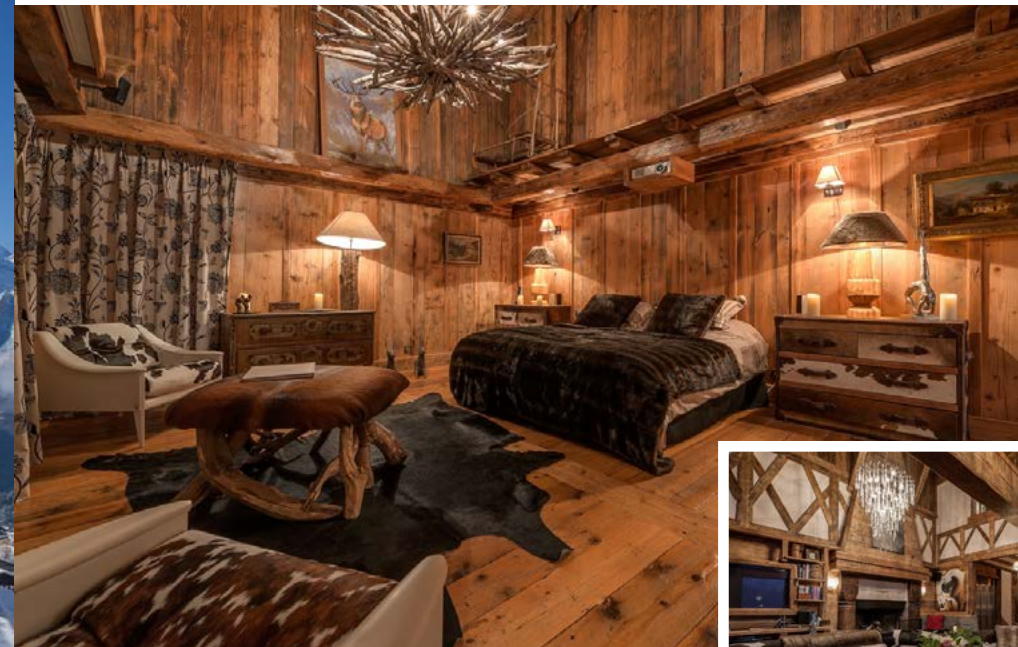
>> Chalet Le Rocher, Val d'Isere

For more information, visit www.leccollectionist.com