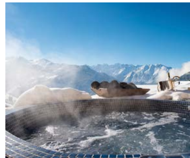
Chalet Chouqui, Verbier, Switzerland

For more information, visit www.ultimateluxurychalets.com