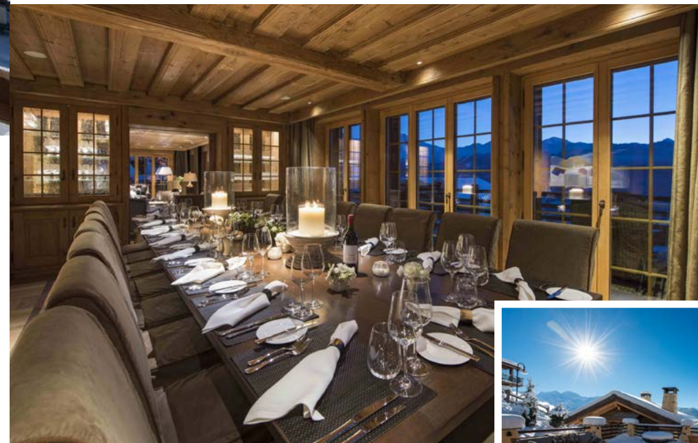
>> Chalet Chouqui, Verbier