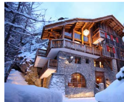
Chalet Le Rocher, Val d'Isere, France