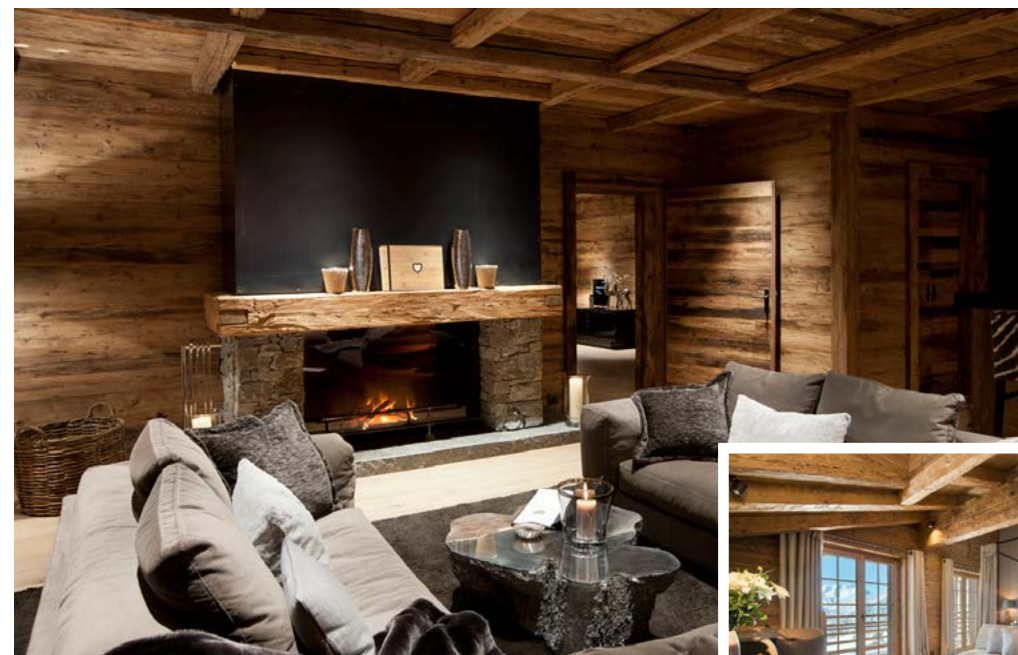
>> Chalet Carl, Lech