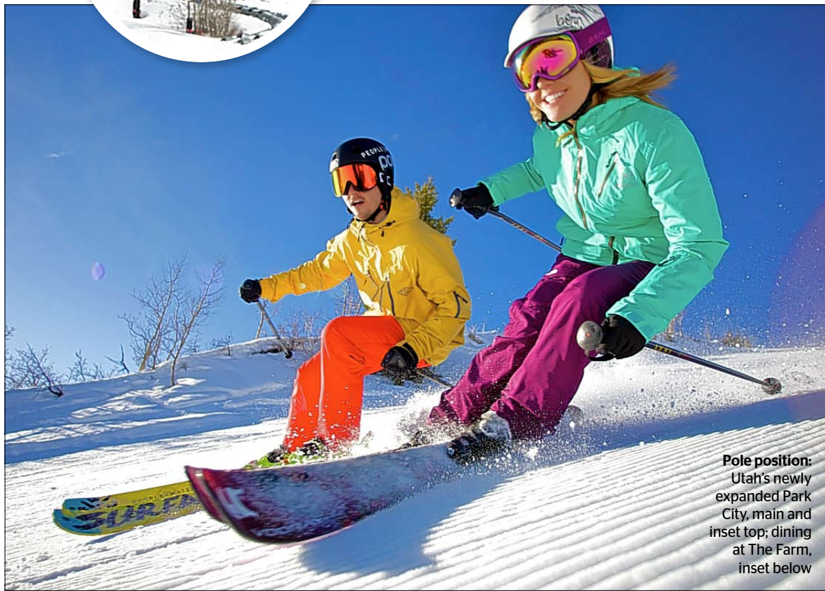
Pole position: Utah's newly expanded Park City, main and inset top; dining at The Farm, inset below

Val d'Isère (valdisere.com) is completely reshaping the summit of Solaise mountain above the resort to create a whole new mid-mountain station at 2,500m that will become a hub for skiers and snowboarders. Bulldozers